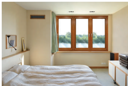
Golden Oak casement window