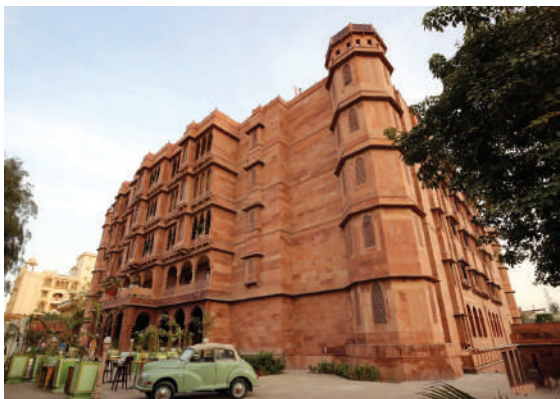
Hotel Narendera Bhawan, Bikaner

The future is going to be very bright and we are ready to cater to the growing market needs in India & beyond.