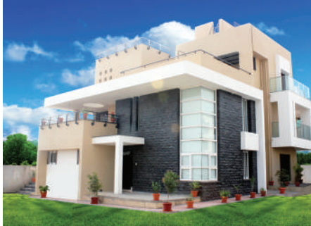
A project at Pune in which Encraft products are used