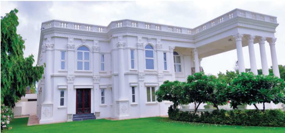
A project in Hyderabad. All our products are backed by warranties

uPVC windows were introduced in India around a decade back. When we started, people did not know uPVC windows and we introduced this new concept and system. We have educated our communities about the importance of uPVC doors and windows and slowly and steadily the market has increased due to various benefits offered by uPVC products. Appreciate all the uPVC fenestration manufacturers, for their meetings and discussions with builders, developers, and real