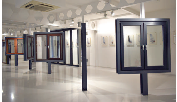
Encraft Experience Centre