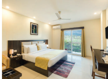
Encraft window adding to the beauty & wellness