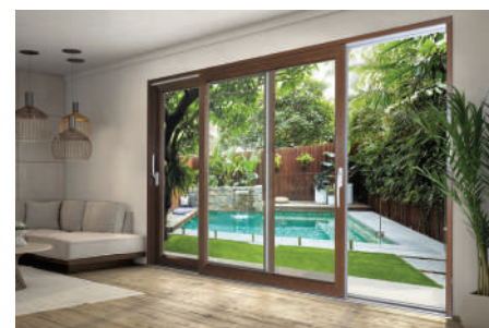
Lift & slide door