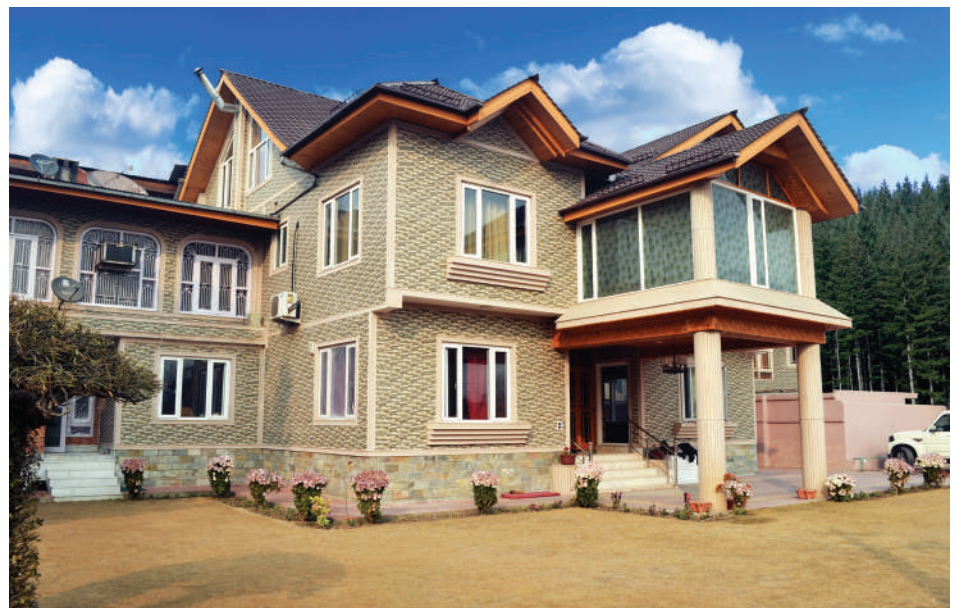
A house by Encraft

Technology & R&D: We have invested a lot in research and development, R&D is deeply