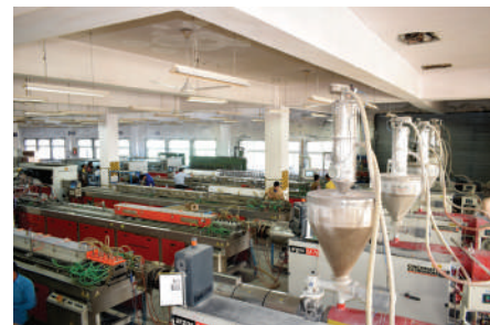
Encraft's complete European state-of-the-art manufacturing facility at Dehradun