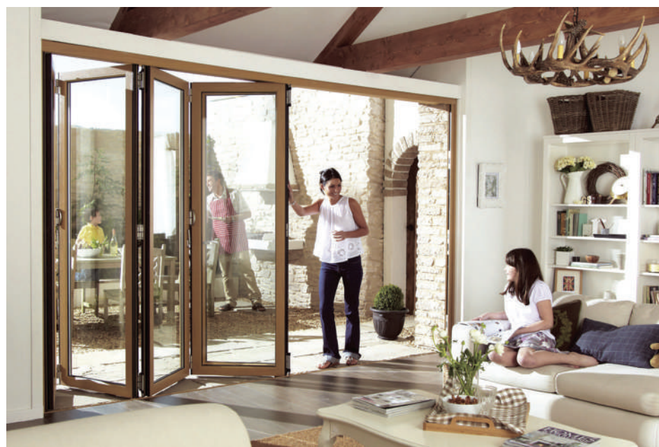
Fold & slide door

The constant evolution of designs and trends has opened many attractive, affordable, and energy-efficient solutions for doors and windows. The past few years have already witnessed the usage of several alternate materials other than wood. uPVC has been one of the prominent materials used widely, however, the industry is expected to witness the next level shift with innovation in design,