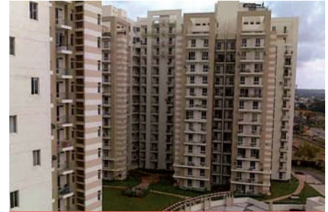
Central Park, A high-rise project in which Encraft fenestration products are used

estate owners to raise awareness of uPVC products.