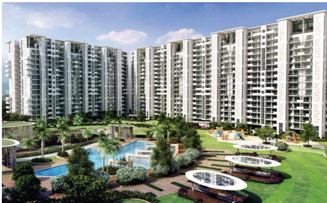
The 3-bhk flats in Mohali Falcon-View: near international airport

Moreover, the brand is 60 years old and known in the market for its high-quality profiles. We strive to be as much eco-friendly as we can and minimise the impact on the environment and protect our mother nature.